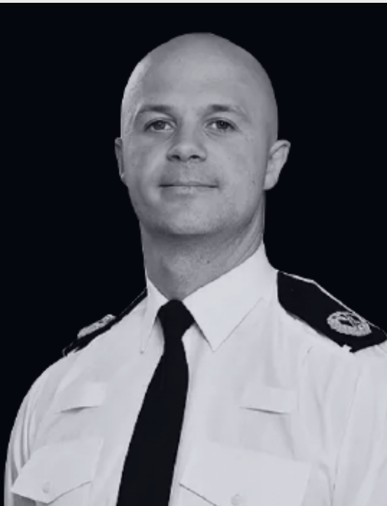
CITY OF LONDON POLICE TEMPORARY COMMISSIONER AND DIRECTOR AT NCRCG, PETE O'DOHERTY

Cybercrime is something that can impact on any individual, family or business anywhere in the country. Being a victim of a cybercrime may not only cause a measurable financial loss but it commonly leaves those impacted feeling violated and vulnerable.